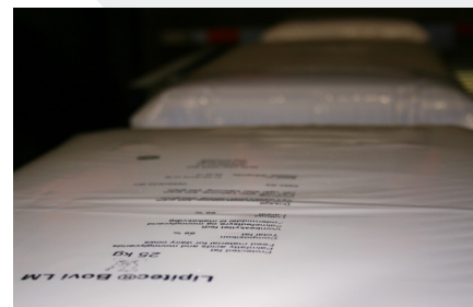
The fully automated solution comprises a bagging machine and a robot for handling the bags, wrapping them in foil and labelling them.

Thomas Ågren was very pleased with the collaboration with Fisker.